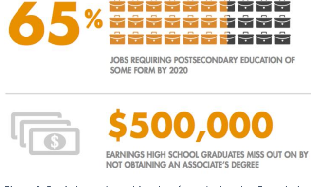
Figure 2. Statistics and graphic taken from the Lumina Foundation, <a href="https://www.luminafoundation.org/todays-student-statistics">https://www.luminafoundation.org/todays-student-statistics</a>