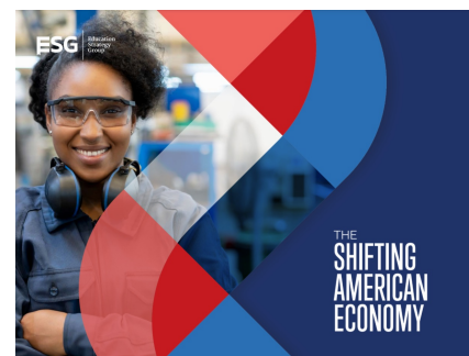
The Shifting American Economy: Key Messages & Strategy Considerations