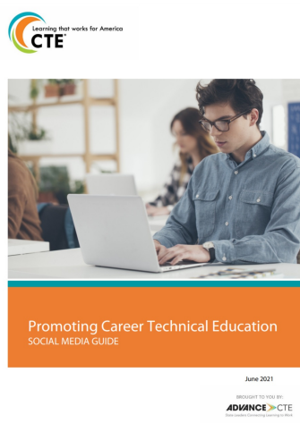
Promoting Career Technical Education: Social Media Guide