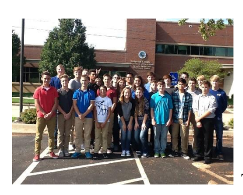
Touring Dept of Corrections