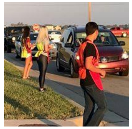
CJ seat belt check