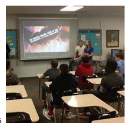
LPSS Day for Middle School