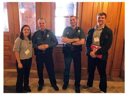
Law Enforcement presentation at state capital by students