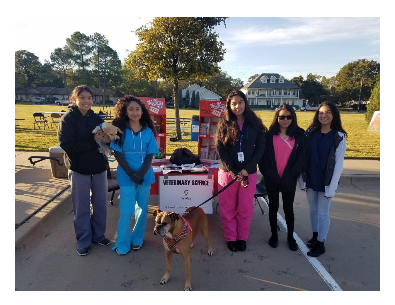
Heritage Senior Citizen Fall Pooch Festival. Vet Science students are always eager to volunteer and support the local community in events.