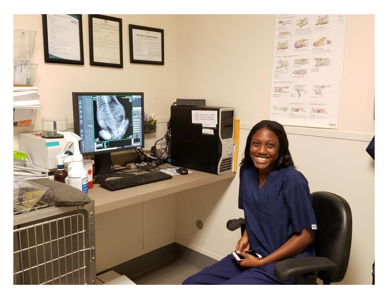
SPCA Radiology Lab. Student gains hands on experience on how x-rays are produced digitally.