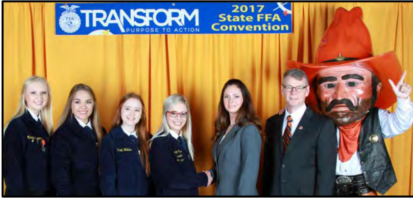
The Agricultural Communications CDE team placed first at the state contest in 2017.

Elgin FFA members compete in many Career Development Events throughout the year, including Agricultural Communications, Opening and Closing Ceremonies, Public Speaking, Food Science and Technology, Livestock Evaluation, Floriculture, Junior Parliamentary Procedure, Agricultural Education, Employment Skills, Floriculture, Milk Quality, Animal Science Quiz Bowl, Greenhand Quiz, and Agricultural Technology and Farm Systems. The multiple CDE areas allow all students to find a place to apply their knowledge in FFA competitions.