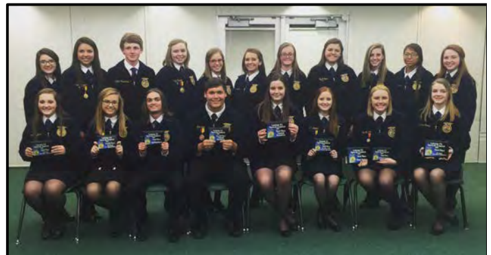
One of the most popular LDEs in the Elgin FFA chapter is public speaking. In April 2016, 20 members participated in the Lawton PI speech contest, and seven of those students advanced to the district contest.