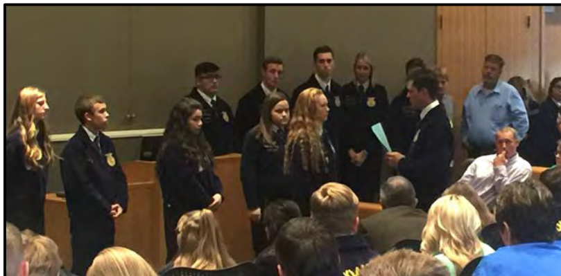
In 2016, an Elgin FFA member made it to the top 5 in the state Greenhand Quiz contest.