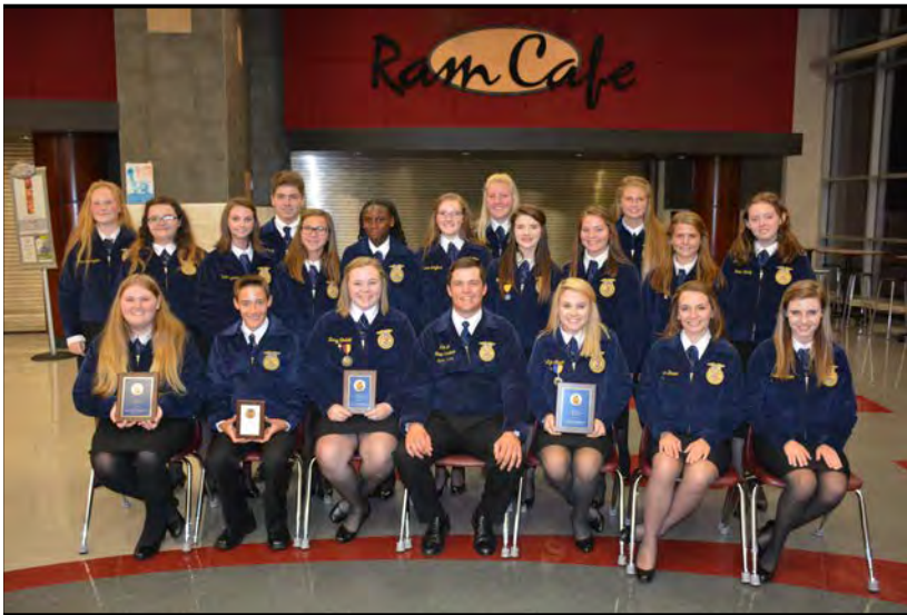
During the fall of 2016, over 38 Elgin FFA students competed in Opening and Closing Ceremonies and the Greenhand Quiz contests.

Elgin FFA members compete in many Career Development Events throughout the year, including Agricultural Communications, Opening and Closing Ceremonies, Public Speaking, Food Science and Technology, Livestock Evaluation, Floriculture, Junior Parliamentary Procedure, Agricultural Education, Employment Skills, Floriculture, Milk Quality, Animal Science Quiz Bowl, Greenhand Quiz, and Agricultural Technology and Farm Systems. The multiple CDE areas allow all students to find a place to apply their knowledge in FFA competitions.