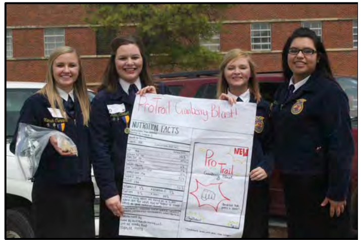
The state winning Food Science and Technology team after the state contest in April 2014.